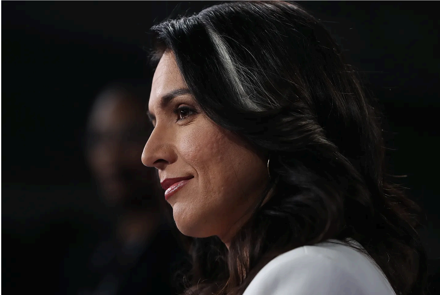
Tulsi Gabbard

ON SUNDAY, WHEN A GOP SENATOR was asked whether Pete Hegseth's excessive drinking could imperil his ability to serve as secretary of defense the senator responded that members of Congress and people in the news media drink a lot too. He encouraged the media to “move on” from such questions.